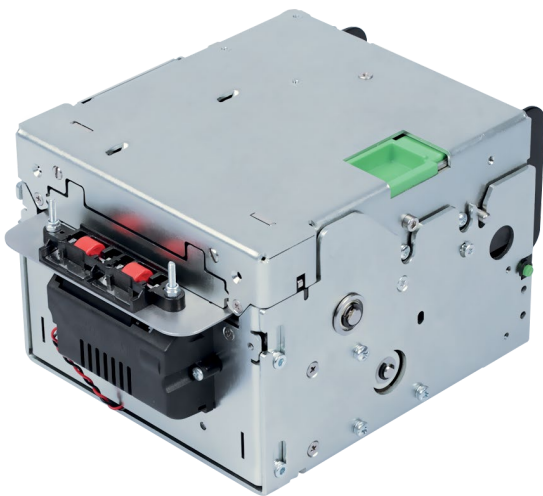
KPM862 - front ejector